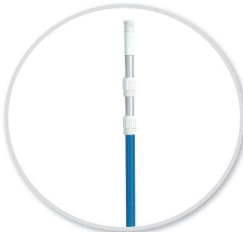
STANDARD VAC POLE