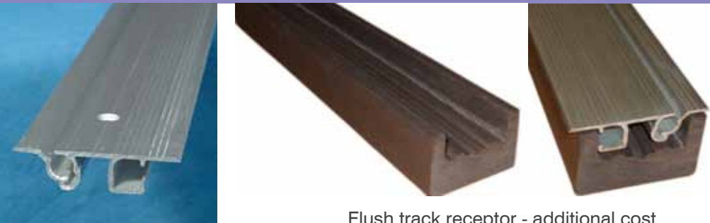
Flush track receptor - additional cost